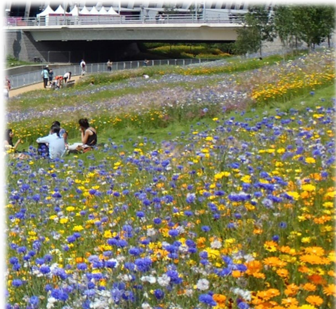
Attractive, wildlife friendly planting