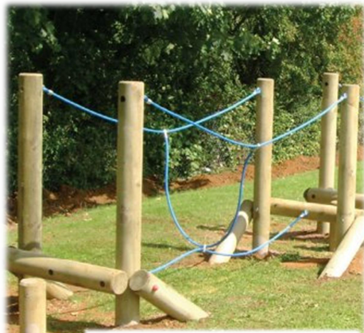
Health and fitness facilities