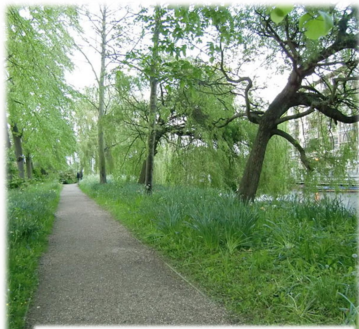
Riverside path to the countryside