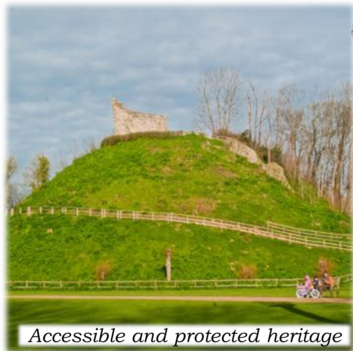
Accessible and protected heritage