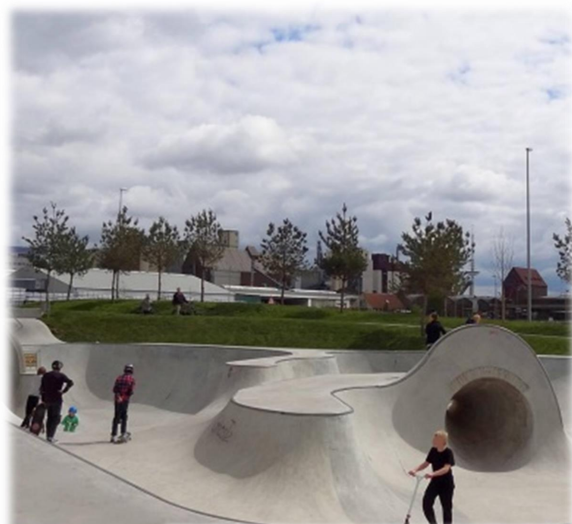
A space for young people