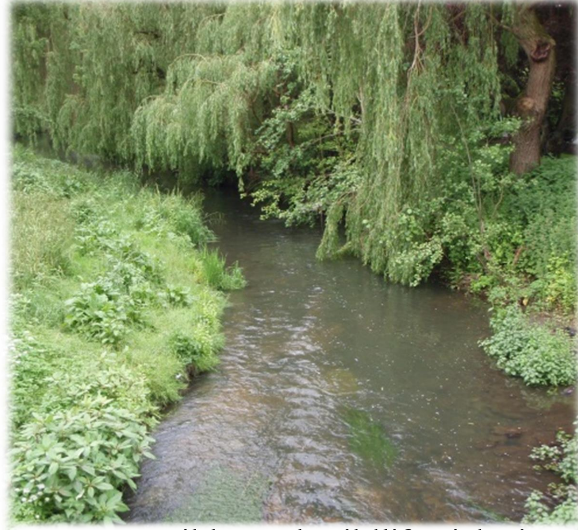
An accessible and wildlife-rich river